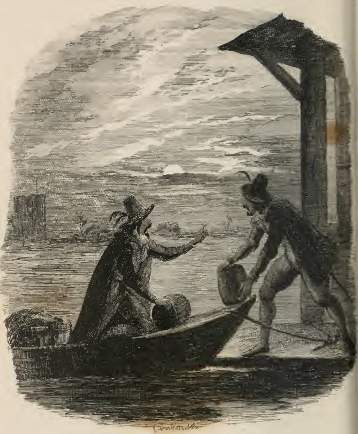
Two Fishes and a Crabby feeding the Birds